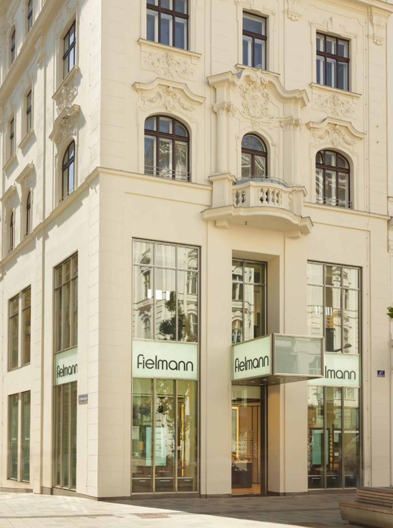
Austria, Vienna, Mariahilfer Str. 67